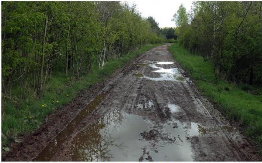
Old path on Nostell Estate

The photos opposite show the 'before' and 'after' with the old and new paths