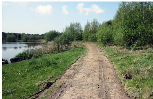
New path under construction