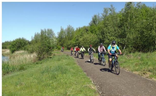
New path in use