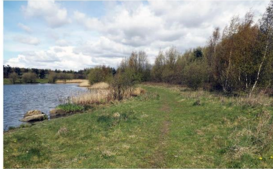
Location for new path