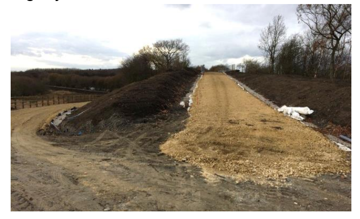
Castleford Greenway Phase 3

Funding for this scheme has now been approved and the contract to do the work has been awarded with completion currently expected to be March 2019 but could be slightly earlier.