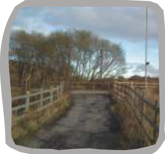
Track onto Spittal Hardwick Road towards motorway underpass (Waymarker 3)