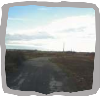
Bridleway towards Wheldale Lane (Waymarker 6)