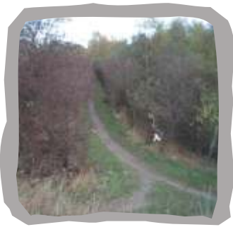
Short steep track alongside motorway (Waymarker 2)