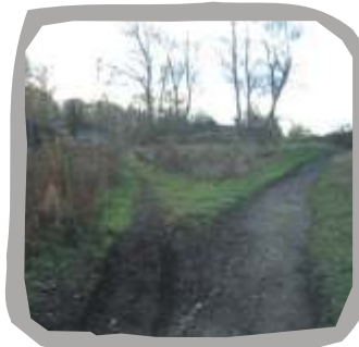
Bridleway towards Wheldon Road (Waymarker 7)