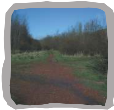
Path through former Lofthouse colliery (Waymarker 5)