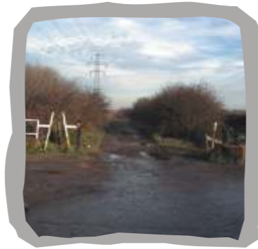
Track running parallel with canal (Waymarker 11)