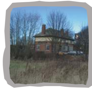
Malt Shovel Inn on Bradford Road (Waymarker 8)