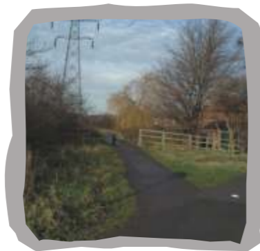
Cycle track off Lime Pit Lane (Waymarker 2)