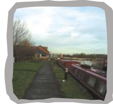
Canal towpath at Stanley Ferry (Waymarker 12)