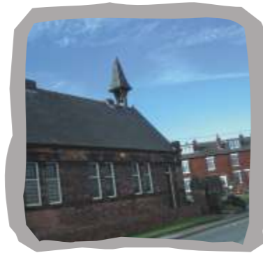
Disused chapel towards Lawns Lane (Waymarker 7)