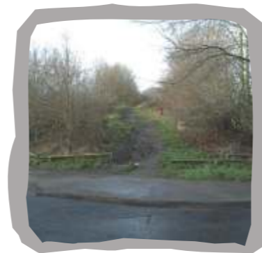
Cycle track off Langdale Avenue (Waymarker 3)