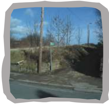
Entrance to Red Hall Lane (Waymarker 9)