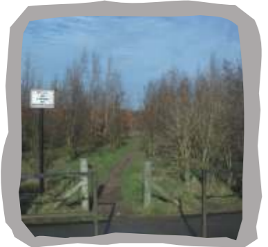
Track onto Ridings Way (Waymarker 4)