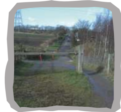
Gate onto Lingwell Nook Lane (Waymarker 6)