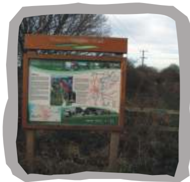
Bridleway leading to Aberford Road (Waymarker 1)