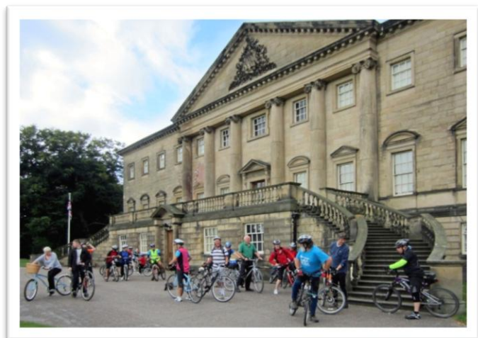
About to leave on a ride from Nostell Priory

More and more people are getting to know about our programme and that is reflected in the numbers we are recording on our health rides' and at our events. Despite having less rides this year we had an increased number of participants with attendances increase at nearly all of our venues. Nostell Priory remains our most popular venue with an average attendance of 15 riders for our Sunday rides there but Pugneys is proving nearly as popular and our new Saturday rides from Anglers Country Park attracted an average attendance of 11.