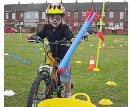
Having fun on the Cycle skills course at Kinsley