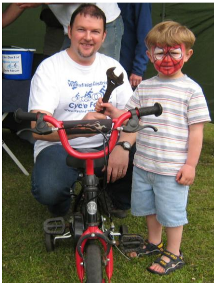
An unusual client for the Bike Doctor