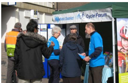
The forum information stall in the Cathedral precinct