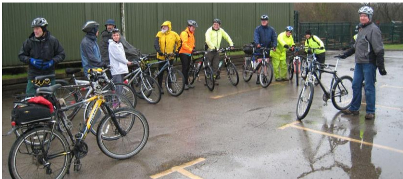
The rain does not deter 11 volunteers attending a cycle leaders training course

This map display board is located at Walton Country Park. It illustrates the cycle routes on and around the Wakefield Wheel Cycle Route devised by David Keighley. Two other displays are located at Pugneys and Anglers' Country Park and it is hoped to locate a display at Nostell Priory.