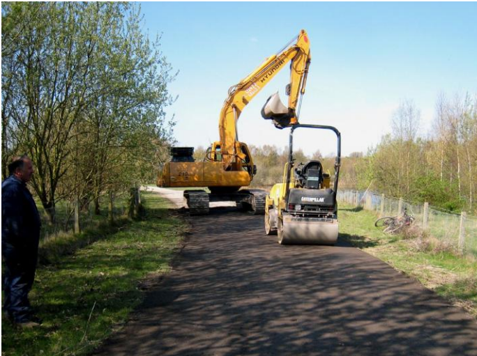
Path being laid through Walton Country Park earlier this year

The Crofton project is part of a planned longer route between Crofton and Walton, linking to the Sandal Curves cycle path to Sandal and Agbrigg Station.