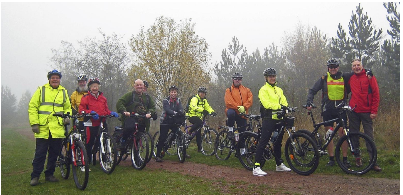
Taking a rest on the way back to Nostell Priory

As you can see from the photographs our winter programme of rides has attracted a good crowd of hardy participants. We only run three rides every month but they have proved even more popular this winter. Despite being blessed with good weather most of the time we all look forward to a bigger programme than ever before of sunny, summer rides.