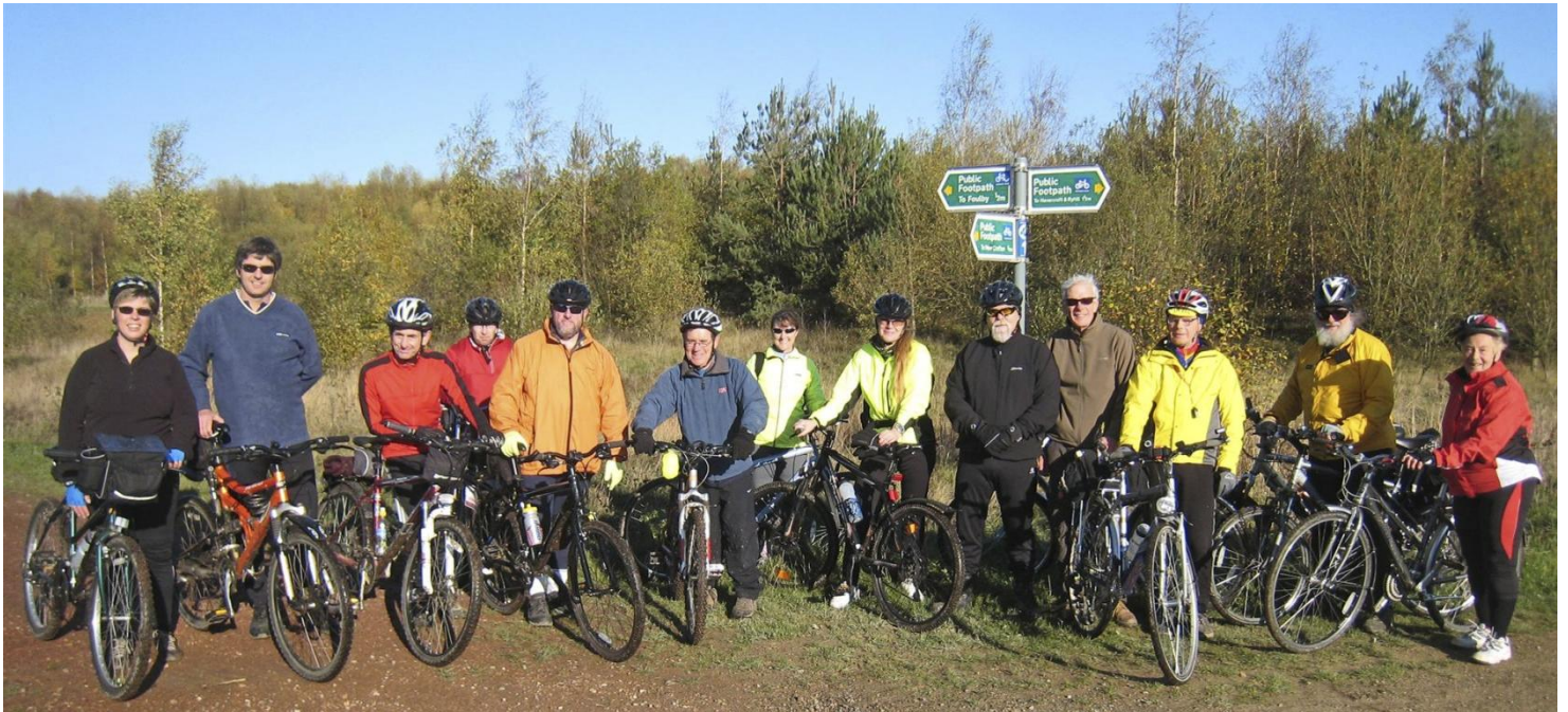
A Pugney's Ride at the Crossroads

As you can see from the photographs our winter programme of rides has attracted a good crowd of hardy participants. We only run three rides every month but they have proved even more popular this winter. Despite being blessed with good weather most of the time we all look forward to a bigger programme than ever before of sunny, summer rides.