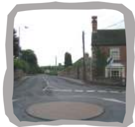
Mini roundabout on Wood Lane (Waymarker 3)