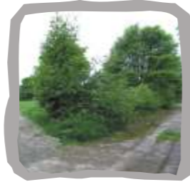
Track towards Winterset Lane (Waymarker 9)