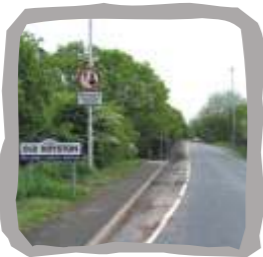
Railway bridge towards Nabby Lane (Waymarker 7)