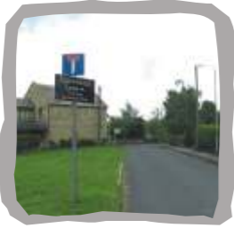
Applehaigh Lane (Waymarker 6)