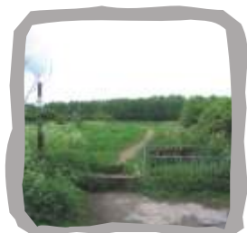
Path from Wood Lane (Waymarker 4)