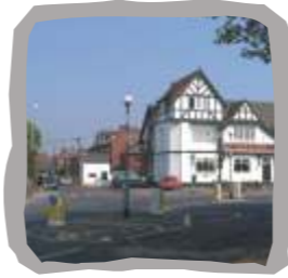
Duke of York pub, Belle Vue Road (Waymarker 17)