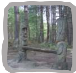
Bench in Haw Park (Waymarker 11)