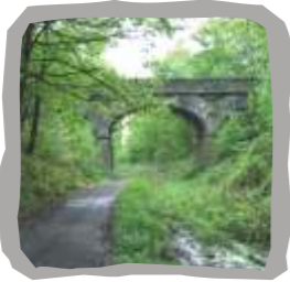
Bridge on disused railway (Waymarker 5)