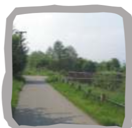
Path towards Pugneys Country Park (Waymarker 19)