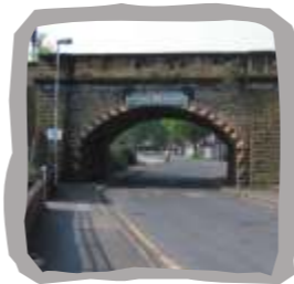
Railway bridge towards cycle path (Waymarker 18)