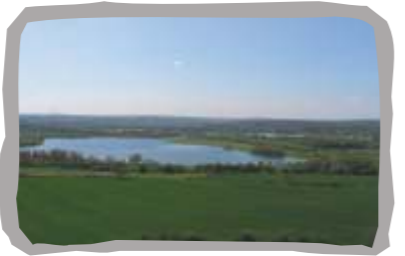
View of Pugneys Country Park from Sandal Castle