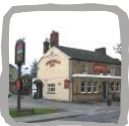
Sportsman Inn pub, Station Road (Waymarker 8)