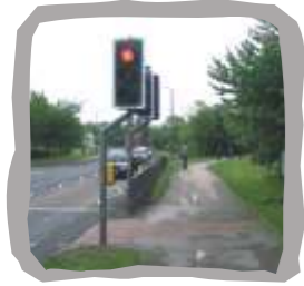
Path to St George's Walk (Waymarker 2)