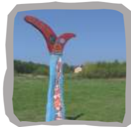
Totem Pole within Nature Park (Waymarker 15)