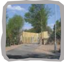
Cycle path towards station car park (Waymarker 16)