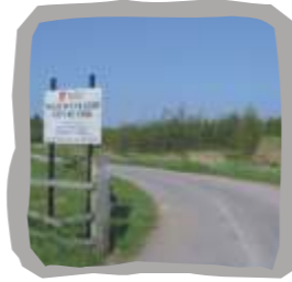
Entrance to Walton Nature Park (Waymarker 14)