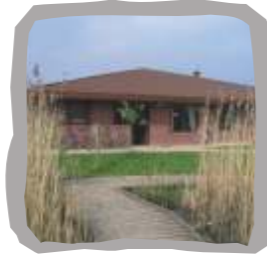
Anglers Country Park, Discovery Centre (Waymarker 10)