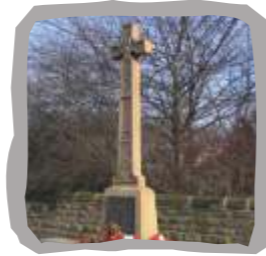
Walton War Memorial (Waymarker 13)