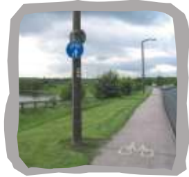
Cycle path down Asdale Road (Waymarker 1)